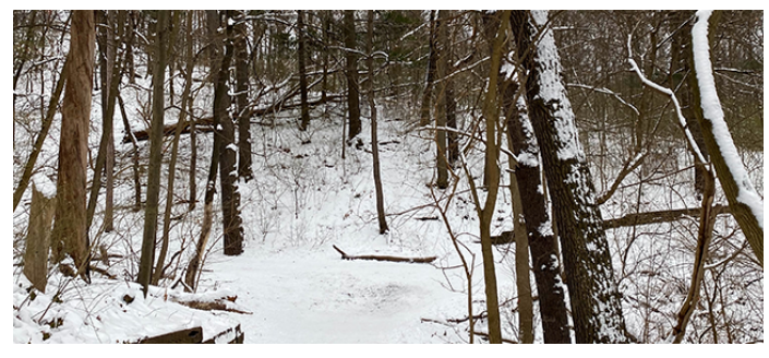
Forest trail leading down to Grenadier Pond in High Park.

against, and beyond it. The activity, which traversed from the park's north entrance down the forest trails to Grenadier Pond, was punctuated by text excerpts narrating the history of the park that we sporadically gave participants to read aloud; starting with the official placard of John Howard's benevolent gift of the 'wooded resort' to the citizens of Toronto, and confounded in turn by pre-existing activity of Indigenous people along an important Indigenous trade route dating back 11,000 years. These excerpts told just some of the myriad stories that make up the park's past and present.